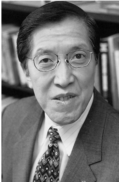
Derald Wing Sue

racial microaggressions has been proposed to explain their impact on the therapeutic process.